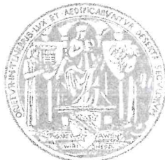
SENIOR VICE-CHANCELLOR IS-GANGHELLOR HŶN