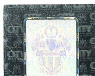
Director of Programme City Law School