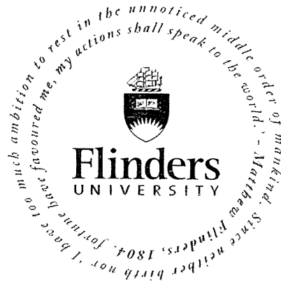
President and Vice-Chancellor