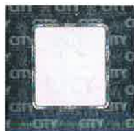
Director of Programme City Law School