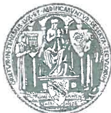
SENIOR VICE-CHANCELLOR IS-GANGHELLOR HYN